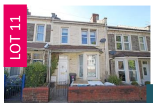
LOT 11 186 Wick Road, Brislington, Bristol BS4 4HN GUIDE *£285,000+

Terraced house offering spacious living accommodation including 3 reception rooms, extended kitchen & 3 bedrooms.