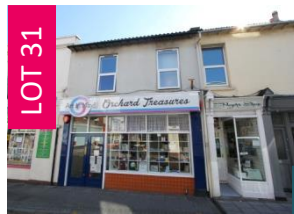
LOT 31 34a Orchard Street, Weston-super-Mare BS23 1RQ GUIDE *£60,000-£70,000

Well presented first floor 2 bedroom flat situated in a central location in Weston-super-Mare.