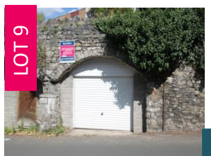
LOT 9 Tandem Garage, Chock Lane, Westbury-on-Trym, Bristol BS9 3HA GUIDE *£20,000 - £30,000

Vaulted stone-built tandem garage with up and over door situated in a prime residential location within walking distance to Westbury on Trym.