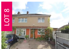
LOT 8 4 Modecombe Grove, Henbury, Bristol BS10 7PF GUIDE *£100,000+

Spacious and very well presented two bedroom garden flat of non-traditional construction benefiting from a secure gated driveway providing off-street parking for several vehicles.