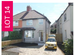
LOT 14 41 Queens Road, Bishopsworth, Bristol BS13 8LF GUIDE *£190,000+

Attractive and partially renovated 1930's 3 bedroom semi-detached house in need of some finishing. This would make an ideal family home or buy to let investment.