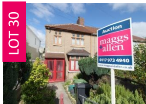
LOT 30 16 Berkeley Road, Fishponds, Bristol BS16 3LX GUIDE *£135,000+

Three bedroom end of terrace house in need of complete refurbishment, benefiting from a sizeable rear garden and garage.