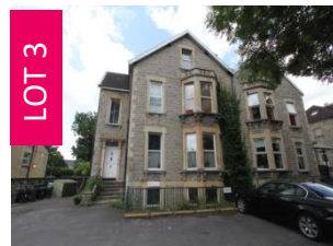
LOT 3 Flat 1, 5 The Avenue, Keynsham, Bristol BS31 2BU GUIDE *£90,000-£100,000

Spacious self-contained one bedroom flat occupying the lower ground floor of this impressive period building. Conveniently located for access to Keynsham train station.