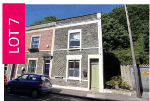
LOT 7 51 Ambra Vale East, Cliftonwood, Bristol BS8 4RF GUIDE *£340,000+

Attractive end of terrace period 2 bedroom house with rear courtyard and garden, situated in a highly sought after location.