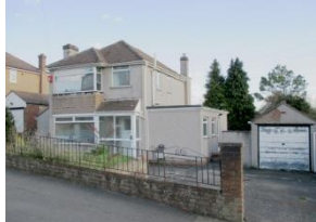
LOT 12 132 Allison Road, Brislington, Bristol BS4 4PQ GUIDE *£250,000+

Three bedroom detached house in need of refurbishment occupying a sizeable plot (approx. 0.23 acres) offering potential for additional dwellings, subject to consents.