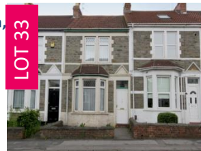
LOT 33 37 Gloucester Road, Staple Hill, Bristol BS16 4SH GUIDE *£135,000+

Attractive period 2 bedroom house in need of updating situated in a popular residential location within close proximity to Page Park.