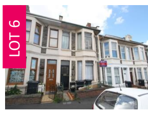
LOT 6 396 Whitehall Road, Whitehall, Bristol BS5 7BU GUIDE *£185,000+

Attractive period terraced property arranged as two 1 bedroom self-contained flats that are both let producing a total rent of £14,940 per annum.