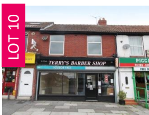
LOT 10 512 Filton Avenue, Filton, Bristol BS7 0QE GUIDE *£150,000+

Investment property comprising a ground floor commercial unit (currently sub-divided into 2 shops) with a non self-contained flat, good sized rear garden and double garage.