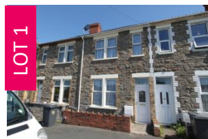
LOT 1 11 Leicester Square, Soundwell, Bristol BS16 4PD GUIDE *£150,000+

Attractive period terraced house in need of some updating situated in a convenient location.