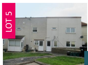
LOT 5 15 Camberley Road, Knowle, Bristol BS4 1SY GUIDE *£200,000+

Freehold residential investment property arranged as 4 self-contained flats capable of producing in excess of £25,000 per annum.