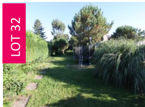
LOT 32 Land r/o 165-167 Whittucks Road, Hanham, Bristol, BS16 3LX GUIDE *£230,000+

Parcel of land with outline planning consent granted for the erection of 2 detached houses with parking and gardens.