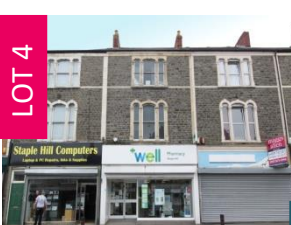
LOT 4 10 Broad Street, Staple Hill, Bristol BS16 5NX GUIDE *£180,000+

Commercial property (approx. 2,850sqft) situated in a prime location on the main High Street.